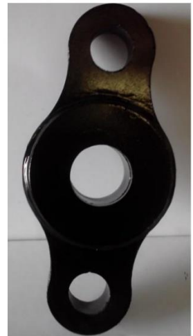
Single 50 Ton Tandem Test Link

When testing with this type of setup, the included angle from one leg to the other across a link may not exceed 10 degrees, or 5 degrees from one lag to the centerline of pull. The hole centers from one side to the other is 10" on these links which will enable the operator to test slings with leg lengths of 48" or more. These are intended only for testing in controlled environments and are not intended for lifting applications.